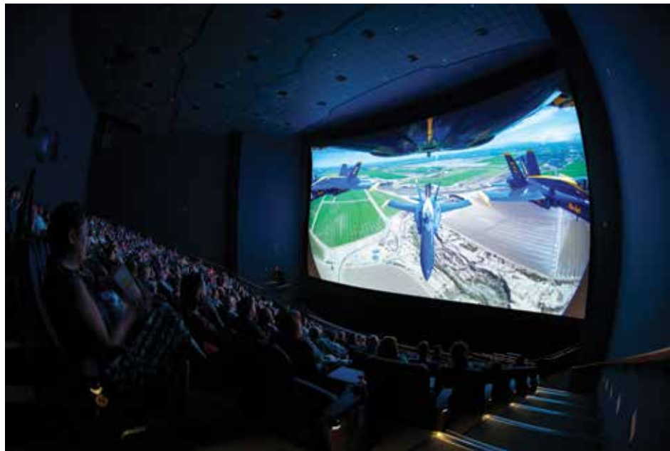
A Christie CP42LH 3P RGB laser system designed by D3D Cinema replaced a film projection system at the Naval Aviation Museum Foundation's large format theater.