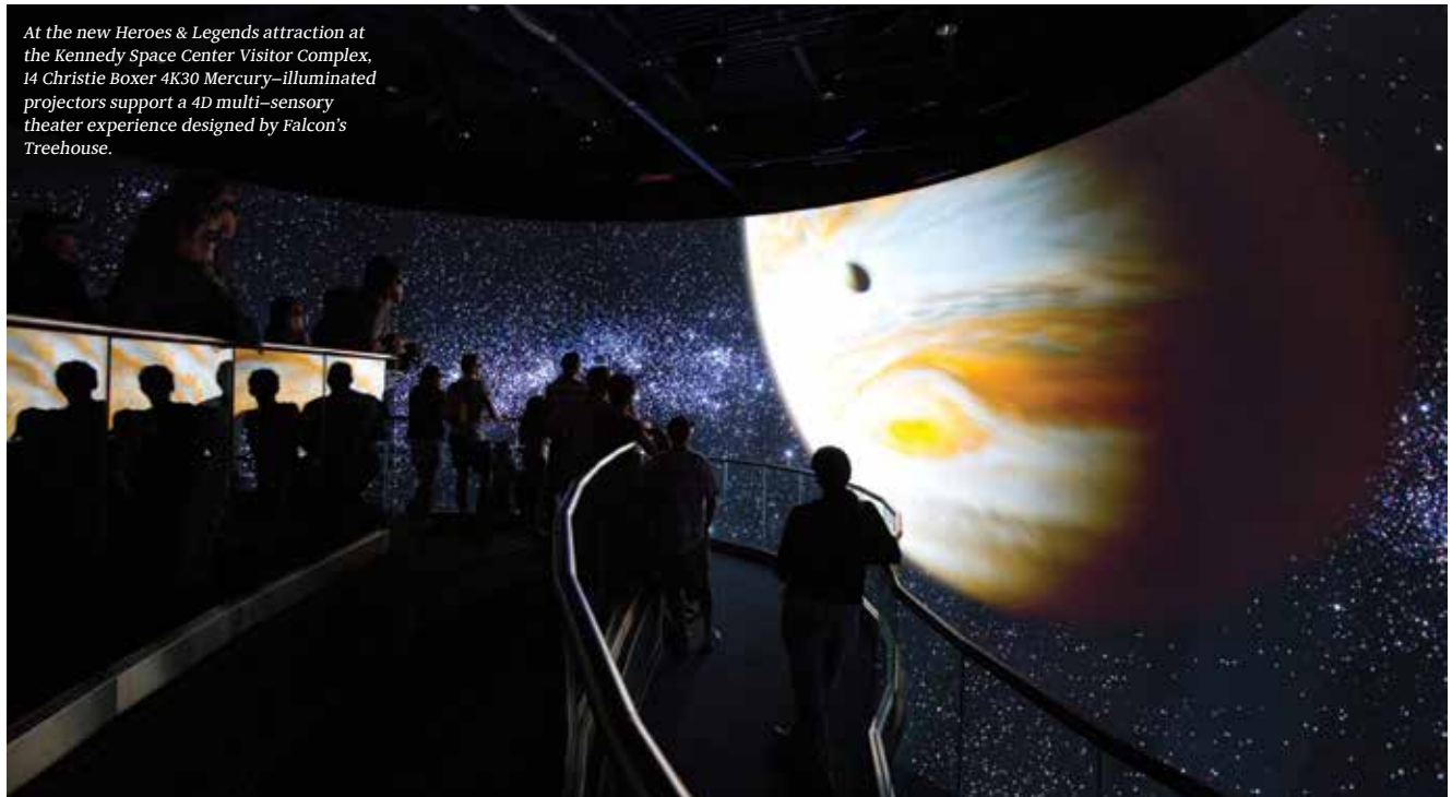
At the new Heroes & Legends attraction at the Kennedy Space Center Visitor Complex, 14 Christie Boxer 4K30 Mercury-illuminated projectors support a 4D multi-sensory theater experience designed by Falcon's Treehouse.

T he surge of activity in laser projectors over the last several years, has had a transformative impact on maintenance and cost of ownership and we can expect the evolution to continue until lasers dominate. But laser projectors have not replaced lamped projectors in all applications. For the highest end custom installations like those in museums and theme parks, systems designers have many variables to balance—screen size and shape, room architecture and throw distance, expectations of resolution and brightness, content type, and more. In these extreme environments, lamp-based projectors are still critical to the tool kit.